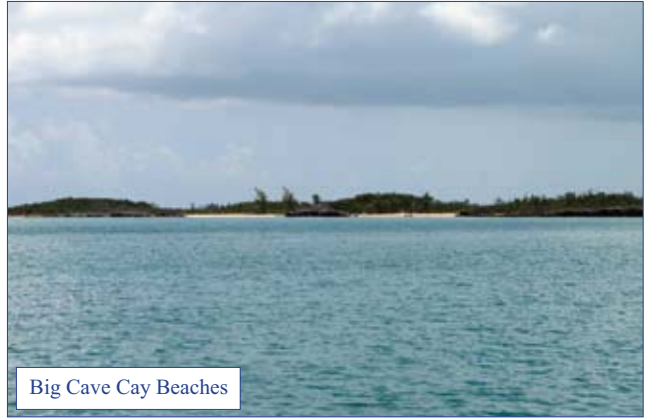
Big Cave Cay Beaches