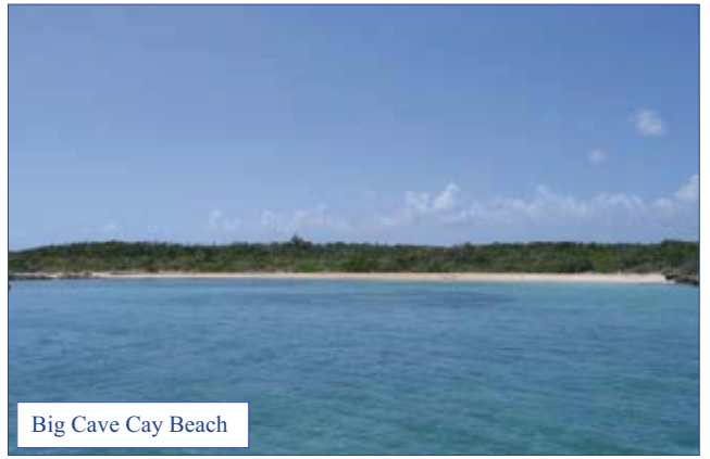
Big Cave Cay Beach