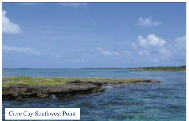
Cave Cay Southwest Point