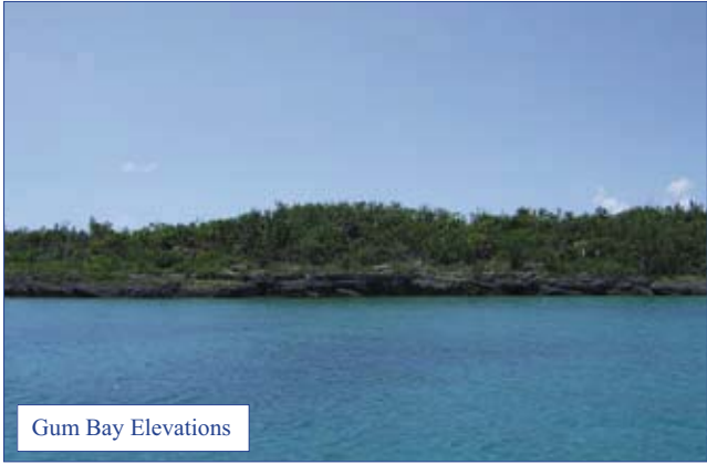
Gum Bay Elevations