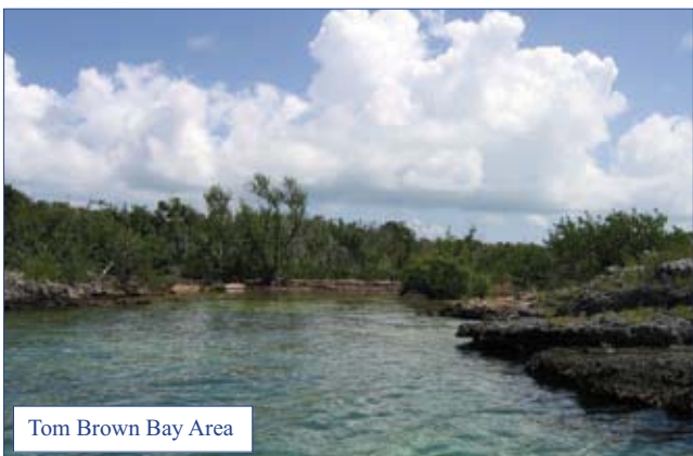
Tom Brown Bay Area