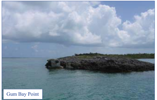
Gum Bay Point