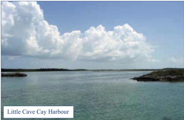
Little Cave Cay Harbour