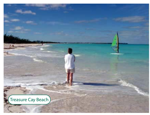
Treasure Cay Beach