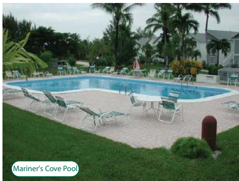
Mariner's Cove Pool