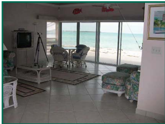
Living Area Overlooking Treasure Cay Beach