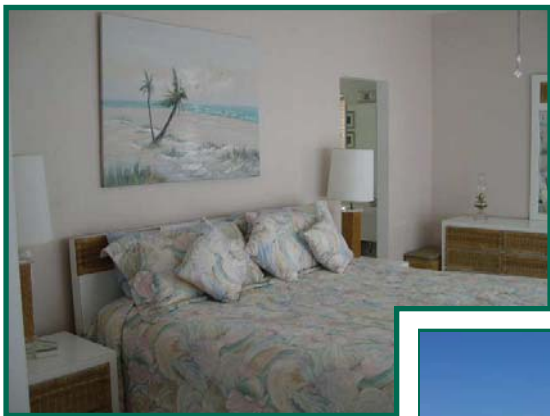
Master Suite Features Ocean View