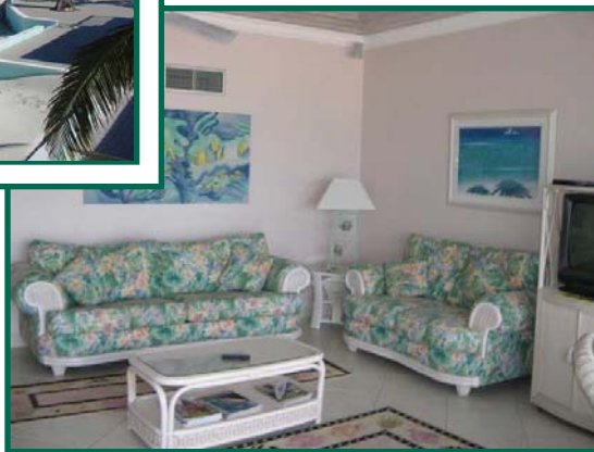
Comfortable Living Area with Tropical Decor