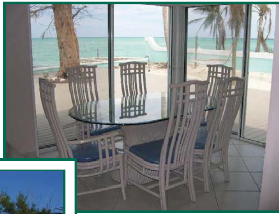
Dining Area with Ocean View