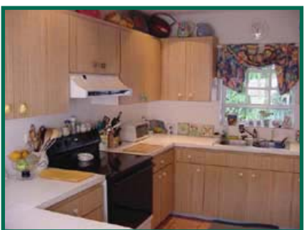
Modern, fully equipped Kitchen

Reference Number: AES 247 - Offered For Sale, Fully Furnished at: $549,000. - exclusive of 1/2 Bahamas Stamp tax and purchaser's legal fees