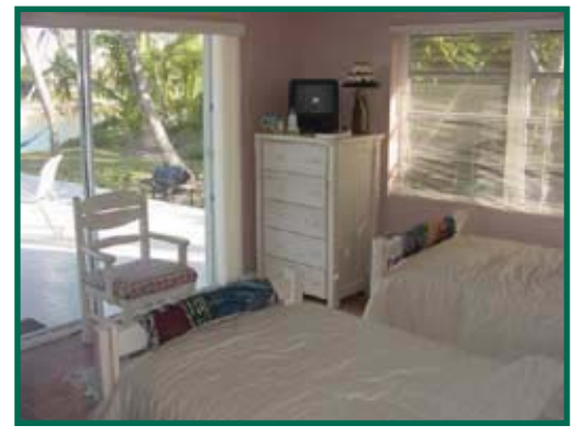
1st Guest Room with Twin beds