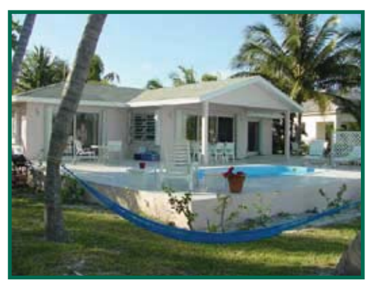
Spacious Yard & Pool