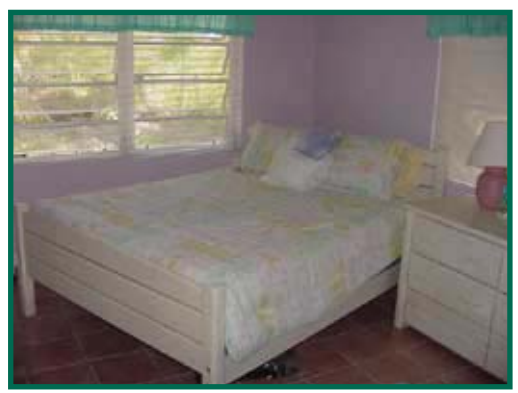
2nd Guest Room with Queen bed plus Single bed