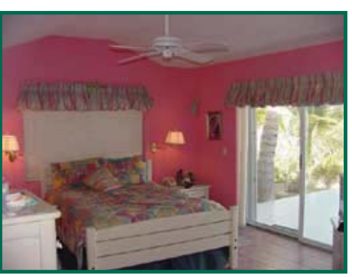
Master Bedroom with Queen bed